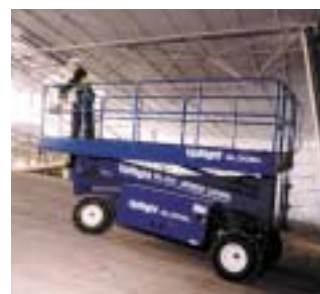
All models have oscillating axles to keep drive wheels in contact with uneven ground and have high levels of gradeability for tough sites and loading ramps.