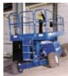
The Speed Level allows fast platform levelling on slopes and uneven ground.