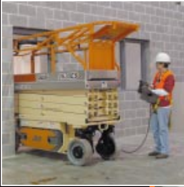
Compact Size and Narrow Width For Ease of Access