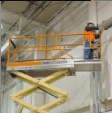
Larger Platforms and Higher Capacities