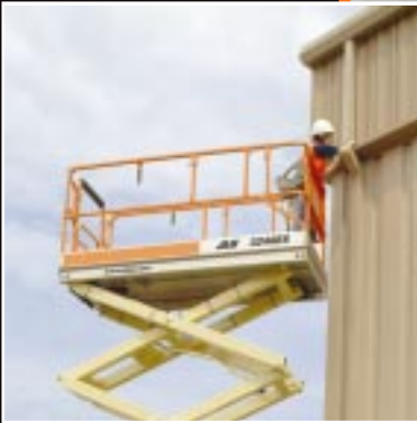
CE Rated for Indoor/Outdoor Usage